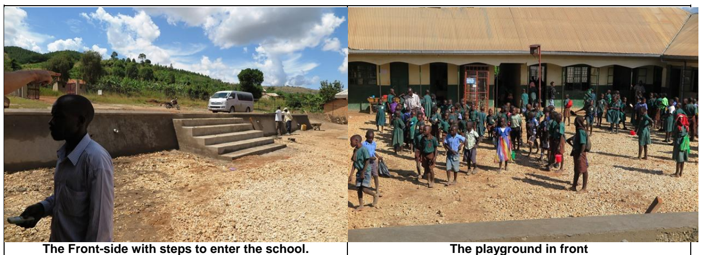
The Front-side with steps to enter the school.

The compound of St. Francis Little Birds Nursery & Primary School is highly sloping with the original school at the low side of the slope. Flooding of rainwater towards and into the school is normal. SFRIM HAS AVAILED € 5.000 FOR THE CONSTRUCTION OF A FLOODING WALL, BOTH AT THE FRONT-SIDE (existing buildings) AS AT BACK-SIDE (new buildings) OF THE SCHOOL.