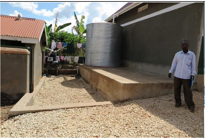
Toilet, rainwater harvesting tank and small stones between the Girls Dormitory and toilet to reach without muddy shoes