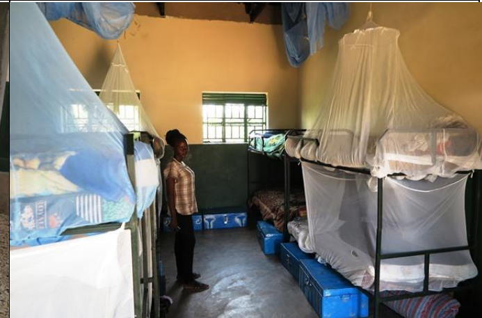
The interior of the Girls Dormitory with brand-new proper beds and bed-nets against the mosquito's (malaria)

Also the Boys Dormitories and toilets can be reached through paths with small stones in order to prevent dirty class rooms or dormitories because of muddy environment.