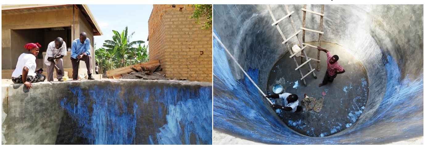
The top will be covered next week