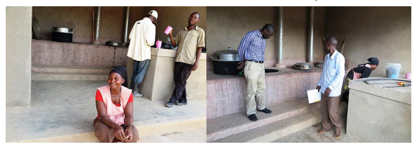
THE "AMÖNEBURG DINING Hall" - 95% ready