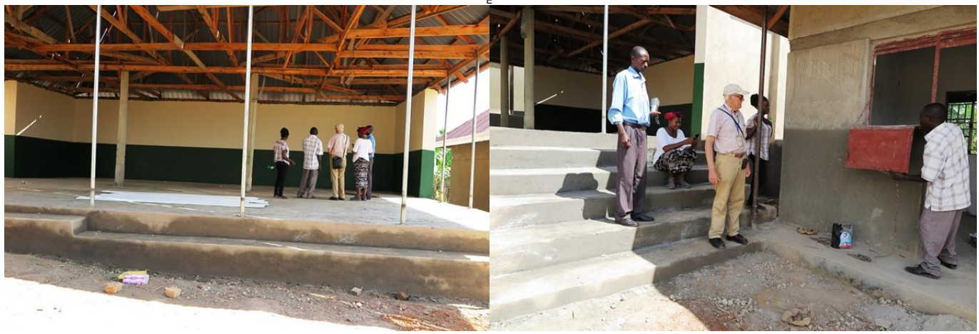
The Amöneburg Dining Hall, almost completed